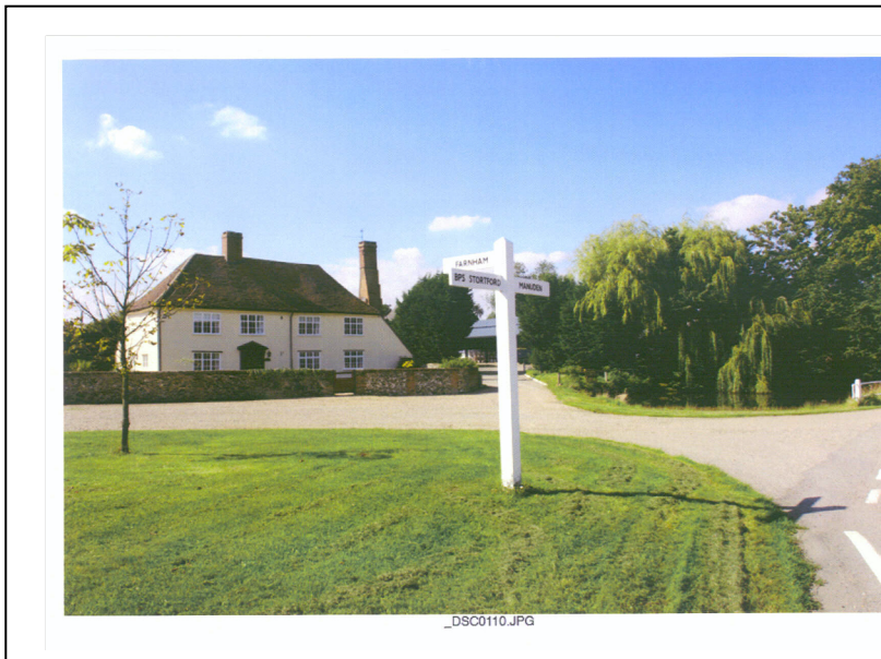
The green and pond, Hazel End, Farnham

PLEASE NOTE: THE ABOVE SUPPLIERS ARE LISTED AS A GUIDE ONLY AND ARE BY NO MEANS A COMPLETE LISTING NEITHER ARE THEY ENDORSED IN ANY WAY BY THE PARISH COUNCIL