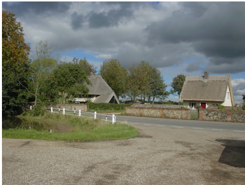
Hazel End, Farnham

Most of the Parish consists of the old Hassobury Estate. The Parish Church was demolished and rebuilt on its present site in 1859.