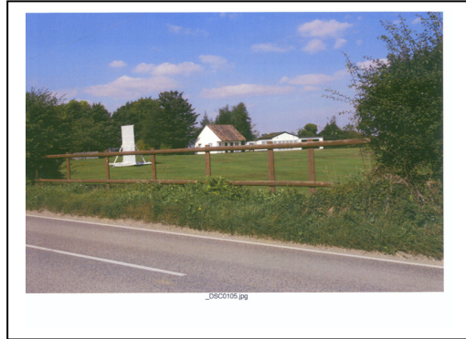
Farnham Cricket Club